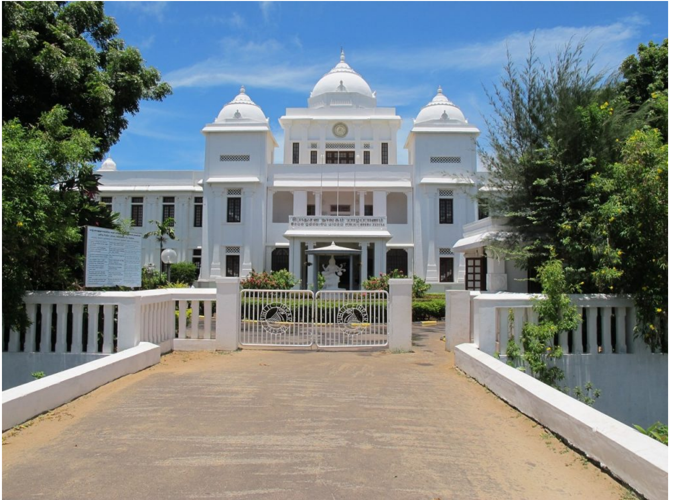
The library of Jaffna