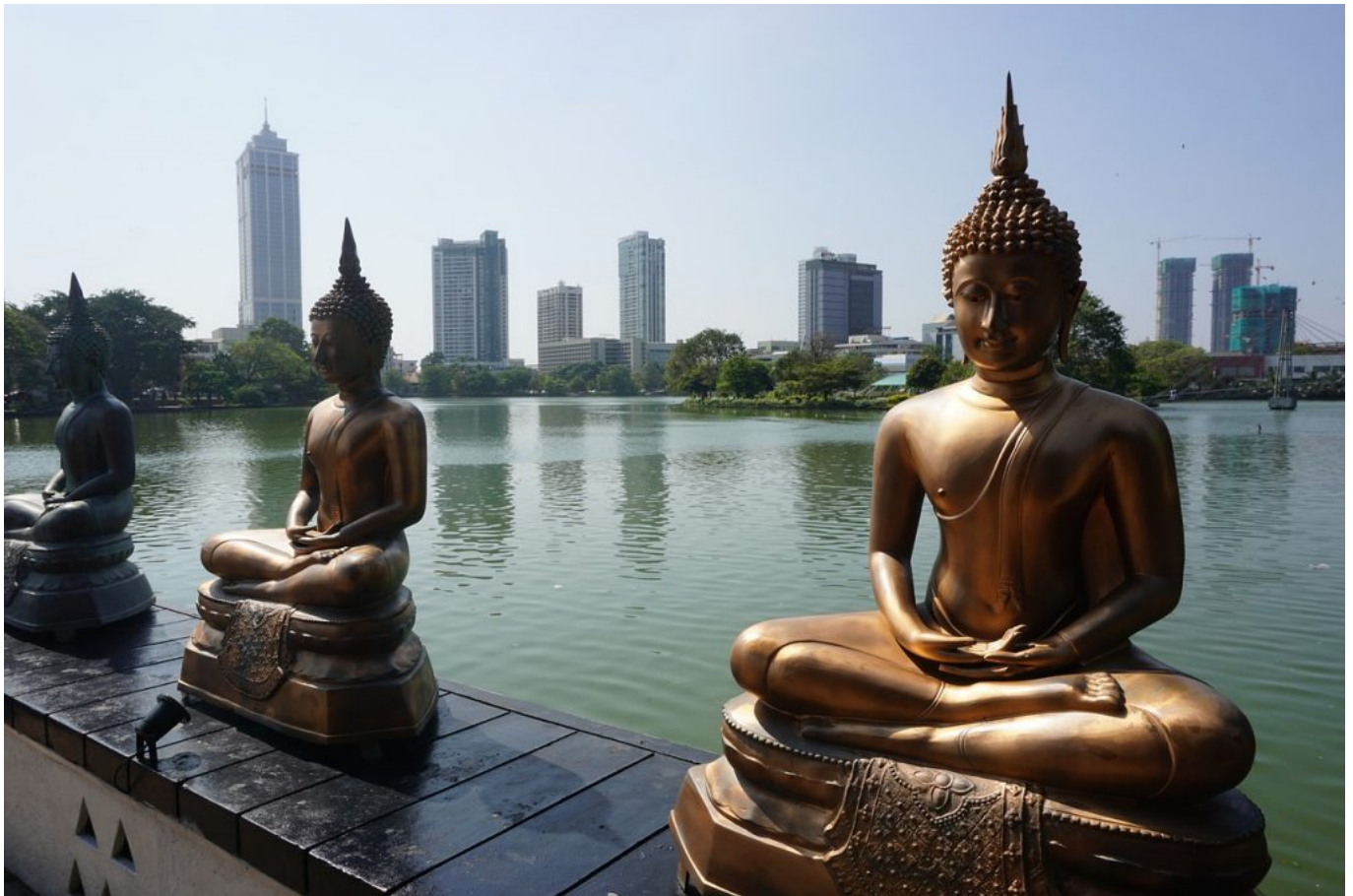
The Skyline of Colombo.