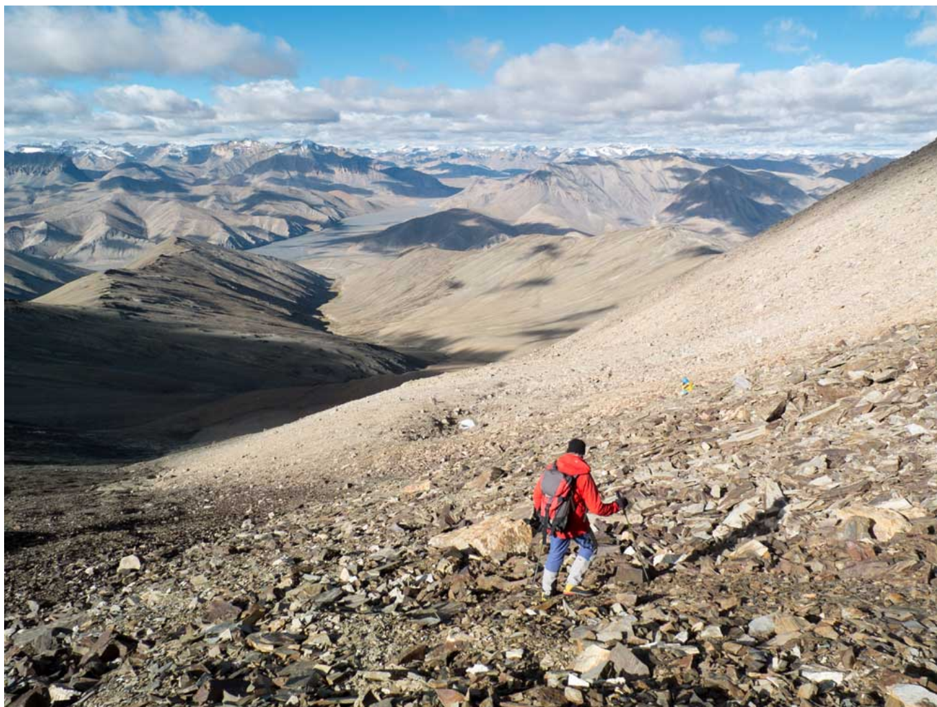
Descent from Mentok II.

Note: For all peaks over 6,000m a permit from the IMF (Indian Mountaineering Foundation) is required and they are subjected to certain restrictions. Additionally, there are some peaks for which no permit is available.